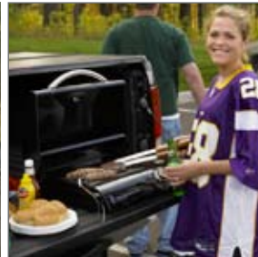
NOTE: Printing color may vary slightly from actual product.