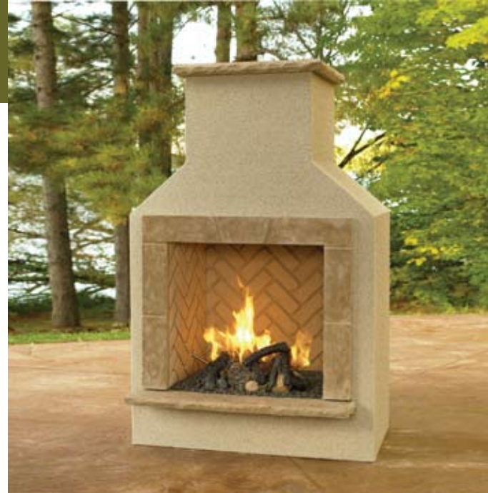
NOTE: Printing color may vary slightly from actual product.

Bring a feeling of warmth to your backyard! With a unique arch design, the San Juan Fireplace is a beautiful addition to your Outdoor GreatRoom™ . The high-heat output will warm you and your guests so everyone can enjoy those cool nights. You won't believe how quickly you can transform your backyard into a wonderful sanctuary for family and friends.