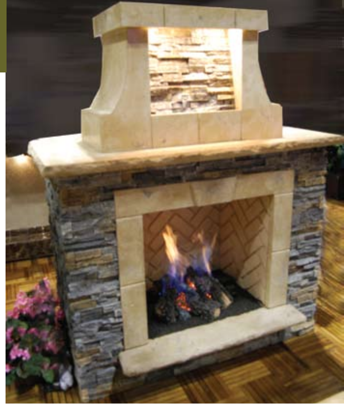
Shown with optional angled chase with water feature.

NOTE: Printing color may vary slightly from actual product.